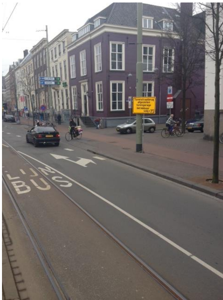
Paard van Troje Prinsegracht 12: